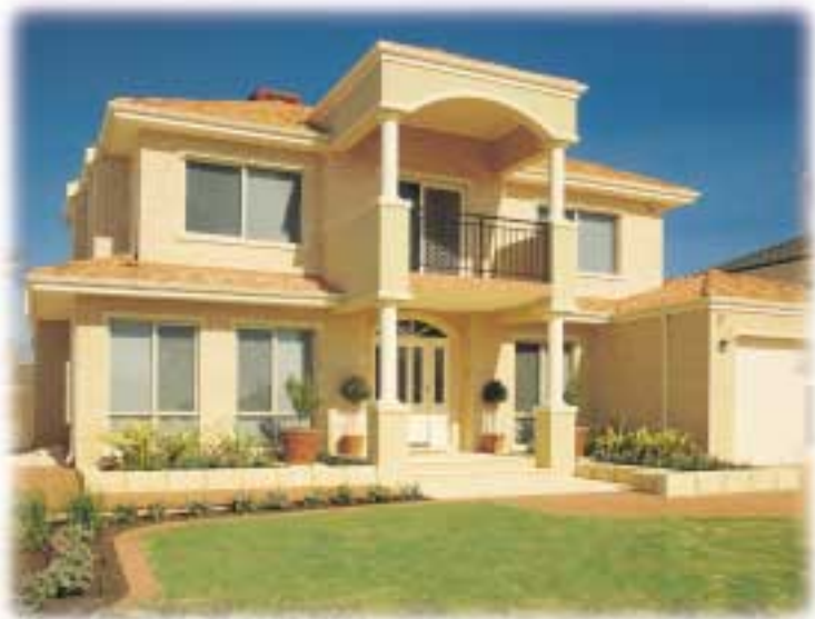
Cream - Collie (WA)

Your home . . . a place that's uniquely you.