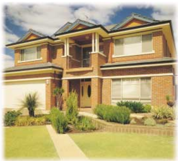
Waterloo - Preston (WA)

Building any form of structure over your weep holes can allow termites to infiltrate your barrier or restrict the drainage of moisture that penetrates your brickwork.