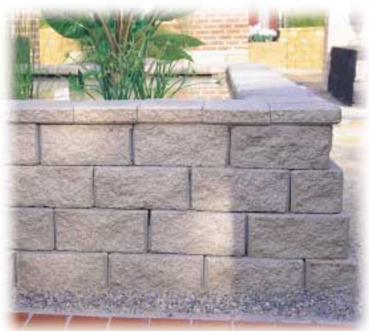
Linkwall - Bluestone (NSW & Vic)