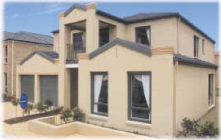
ColorBrik - Coastal Collection (National)

Note: Hydrochloric Acid is commonly used to clean mortar stains from brickwork when it is initially laid. It does not need to be used at any other time during the life of your brickwork. If used incorrectly it can cause unsightly staining that is extremely difficult to remove.