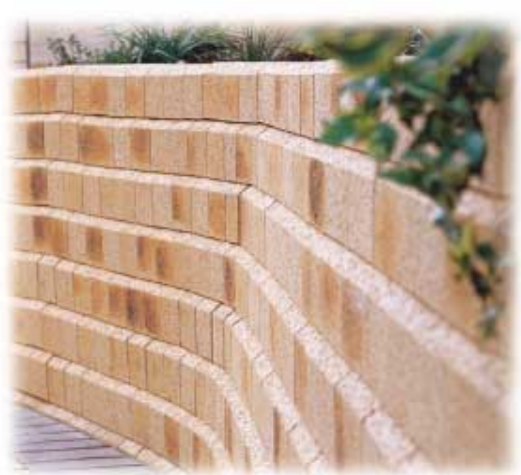
Claylink - Corinthian (NSW & Qld)

To prevent the problem occurring (or re-occurring), treat the surface with a solution of 15g of copper sulphate (blue crystals) per litre of water. Best carried out in late summer when the wall is dry. The copper sulphate will remain in the wall after the water has dried out and inhibit any growth. Copper sulphate is available from fertilizer suppliers or from your pharmacist.