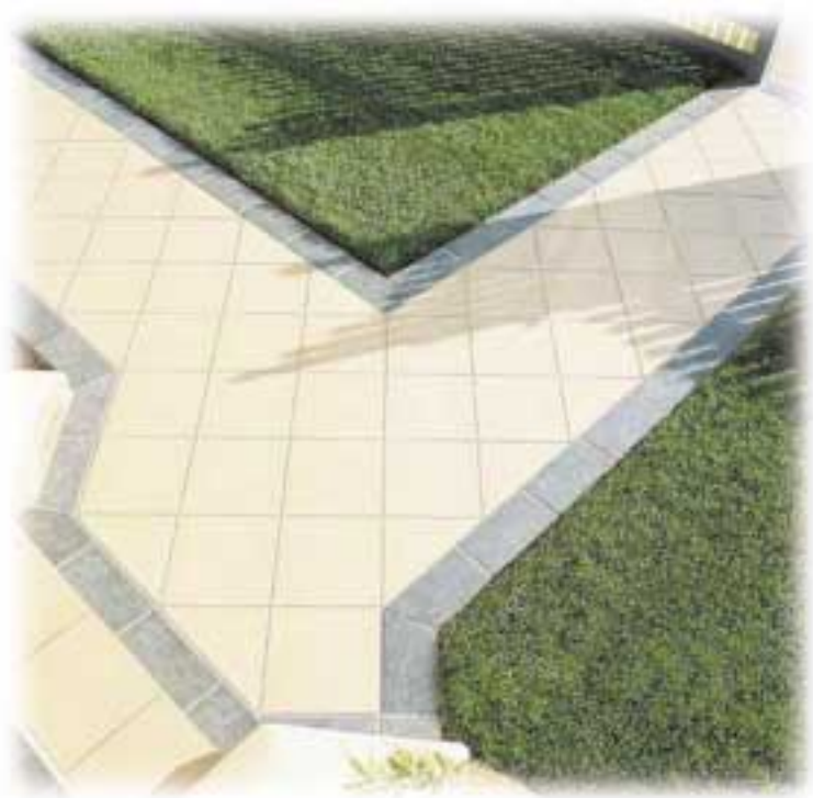
Stontek Series II - Sandstone Body & Onyx Border (National)

There are numerous other staining agents such as blood, ink, egg, coffee and numerous other beverages and foodstuffs, which could come in contact with tiling and require spot cleaning. Abrasive cleaners such as Gumption, etc. should be tried using a plastic scourer. Make sure that you rinse off well afterwards.