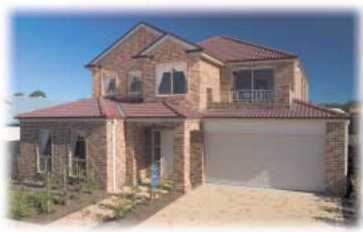
Governor - Davidson Blend (National)

Remedy: Remove with stiff brush when the wall is dry.