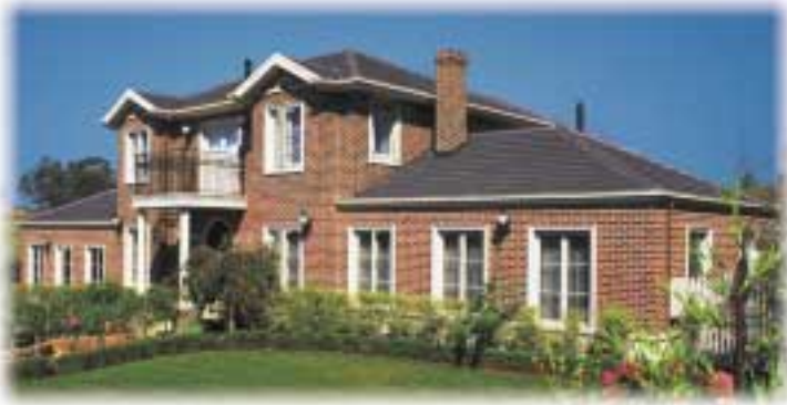
Melbourne - Canterbury