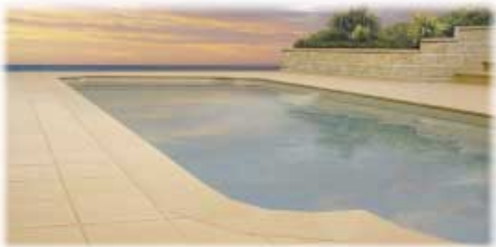
Riviera - Portofino (National)

Warning: Some of the poisons in fungicides may discolour the pavers. Check their effect on a small part before proceeding to clean the whole area. Pay attention to nearby garden plants or lawn, especially on the lower side of the paver area being treated.