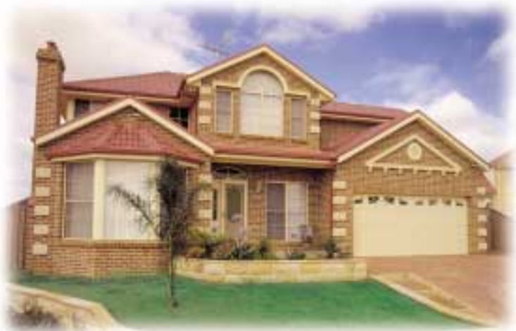
Governor - Gipps (National)

Remedy: Mix a strong detergent solution of one cup detergent to five litres hot water. Scrub and rinse well.