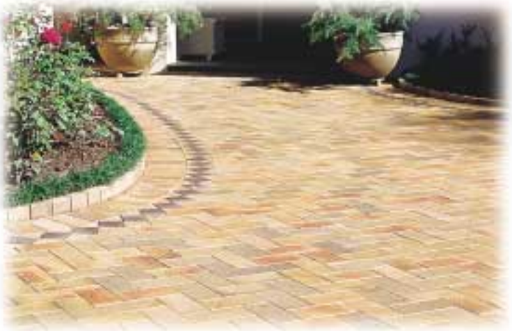
Paradise - Coolangatta