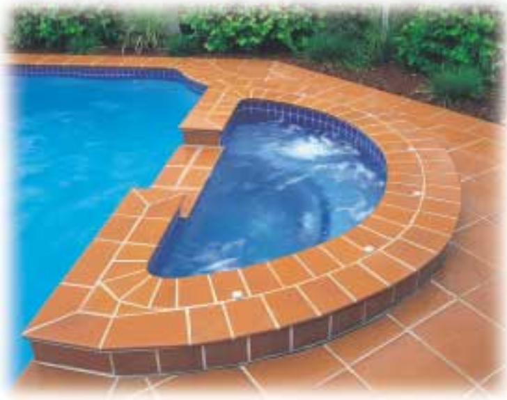
Piazza - Terracotta Red (National)

It should be noted here that although unglazed tiles can stain, there is virtually nothing which will permanently damage them, unlike, say, carpet, vinyl, marble, etc. Tiles are chemically stable and will not be corroded or otherwise permanently affected by staining or most cleaning agents. Thus, if the stain is removed, tiles should look like new again.