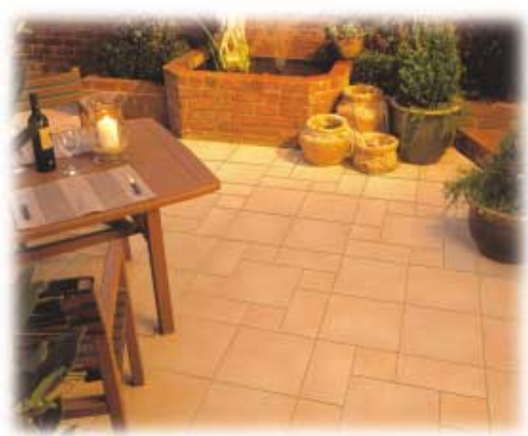
Elegance - Fiaschi (National)

If the degreaser does not remove all the traces of oil and grease, scrubbing with a hard nylon brush and an abrasive cleaner such as Gumption, Vim or Ajax might be necessary as well. Poultice treatments using talc, fullers earth or whiting mixed with mineral turps, may be effective.