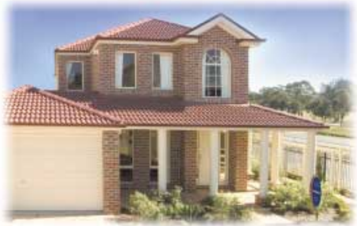
Heritage - Castlereagh (NSW)