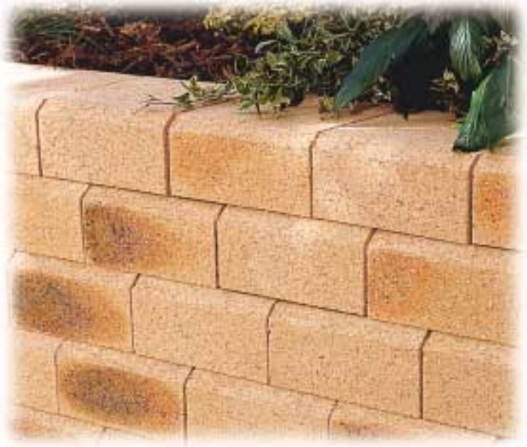
Claylink - Corinthian (NSW & Qld)