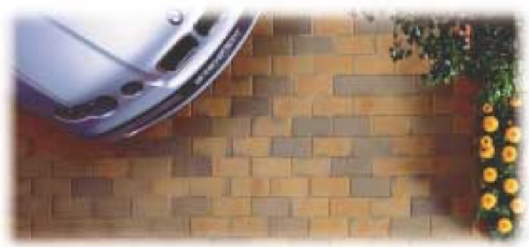
Caribbean - Tabago Fire (National)

To prevent the problem occurring (or re-occurring), treat the surface with a solution of 15g of copper sulphate (blue crystals) per litre of water. Best carried out in late summer when the pavers are dry. The copper sulphate will remain in the pavers after the water has dried out and inhibit any growth. Copper sulphate is available from fertilizer suppliers or from your pharmacist.