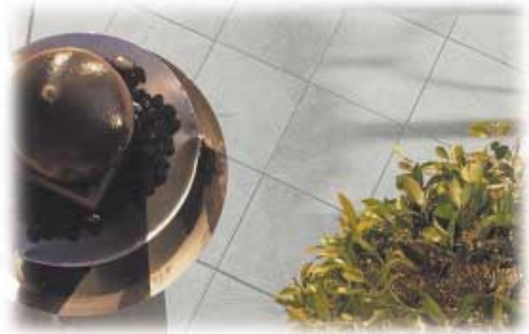
Carrarastone - Glacier (National)

Never use wire brushes, steel wool or steel pads in any cleaning operations as fine pieces of metal left on the surface can cause rust marks, particularly on the grout.