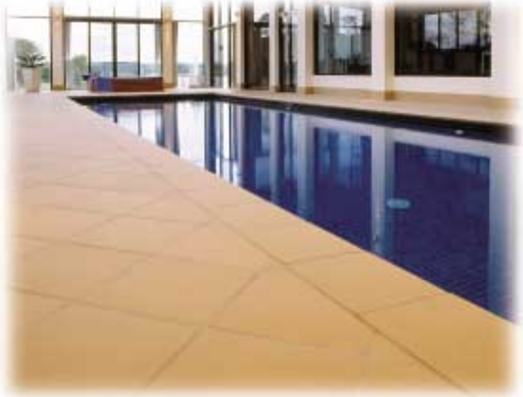
Boulevard - Gold (National)