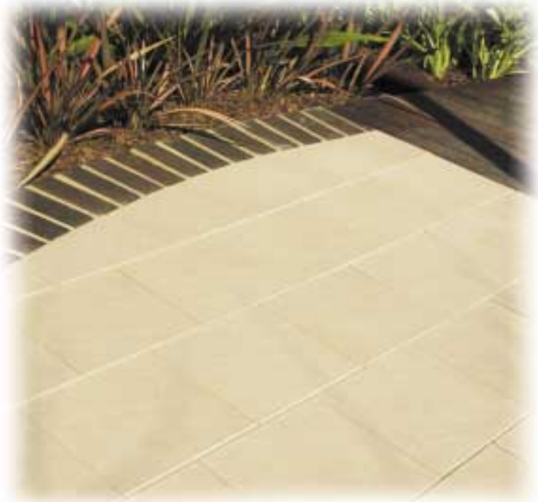
Riviera - Monte Carlo (National)